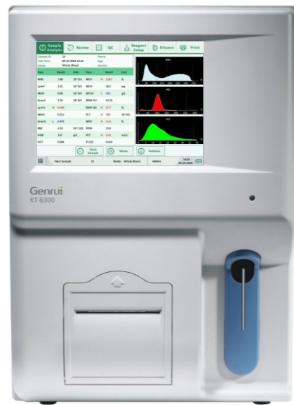
KT-6300 Auto Hematology Analyzer